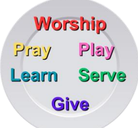
WAYS TO LINK INTO CASTLE ROCK FIRST UNITED METHODIST CHURCH

If you are interested in participating in any of the events listed below, perhaps you could be the VIPP for that event. You would schedule the date and time, consider the options of car-pooling or using the church bus, and coordinate with the person at the park or venue.